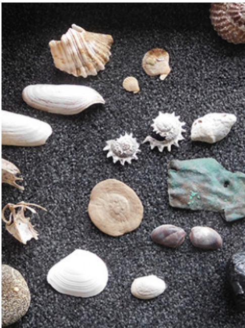
Some beach treasures