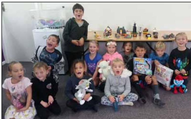
Lego Creators with their prizes.