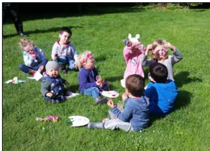
Easter in the garden.